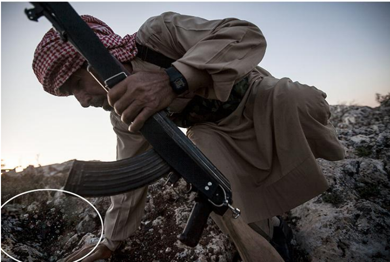
The Associated Press said it severed ties with freelance photographer Narciso Contreras after learning that he had digitally removed a video camera from this 2013 photo of a Syrian opposition fighter.

Photo manipulation has been an issue in journalism even before the doctored portrait of a darkened O.J. Simpson on the cover of Time magazine sparked outrage more than two decades ago. With digital editing tools so easy and ubiquitous, and sophisticated photo manipulation far tougher to detect, the debate is reaching a new pitch.