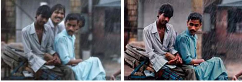
Online sleuths said Steve McCurry erased two individuals and other details, left, from a 1983 photo of men aboard a rickshaw in Varanasi, India, right.

of the World Press Photo Foundation. The unacceptable changes included erasing a window, removing a stain from a wall and altering colors so that the photo diverged from its original in-camera file, according to a person familiar with the entries.